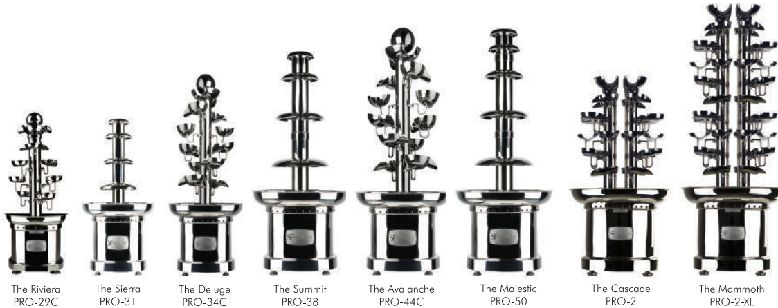
The Riviera PRO-29C